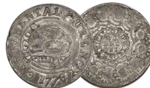
1776 Continental Dollar Pewter, CURRENCY Spelling