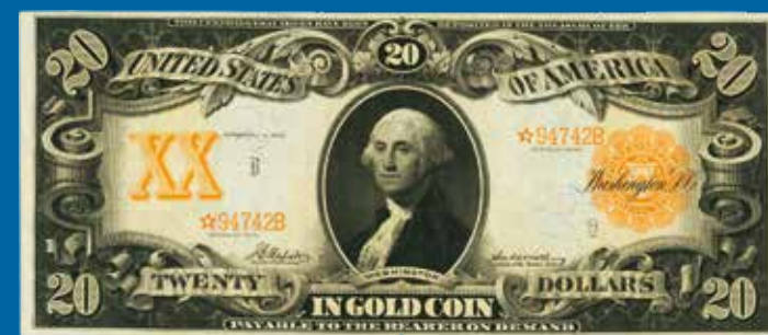
Fr. 1183★ $20 1906 Gold Certificate PMG Choice Very Fine 35 EPQ