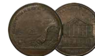
New York Theatre Token