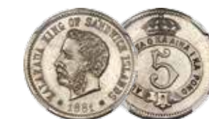
1881 Hawaiian Nickel