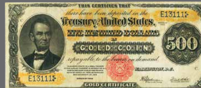
Fr. 1217 $500 1922 Gold Certificate PMG Choice Very Fine 35