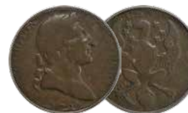
1792 Washington Cent Roman Head