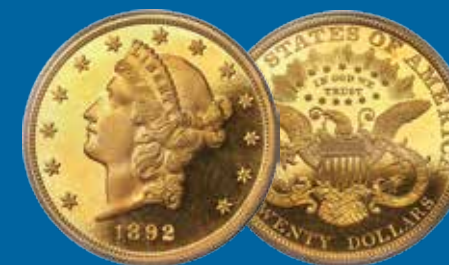
1892 Twenty Dollar, PR65 PCGS Ex: HW Bass, Jr. Collection