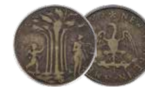
New Yorke in America Token, Brass