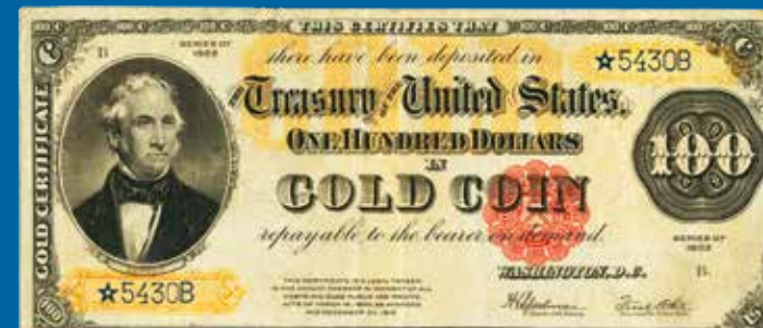
Fr. 1215★ $100 1922 Gold Certificate PMG Very Fine 30