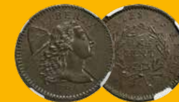
1794 Head of '94 Cent, MS62 Brown NGC S-64, No Fraction Bar