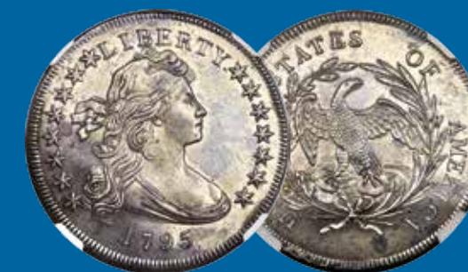
1795 Draped Bust Dollar, SP62 NGC B-14, BB-51