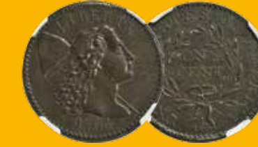
1794 Cent, AU Details NGC S-51, Ex: Hays