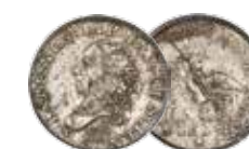
1792 Half Disme