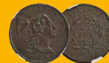
1794 Cent, AU53 NGC S-25, Ex: Dupont