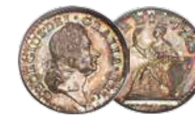
1723 Hibernia Farthing in Silver