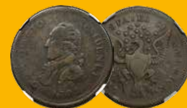
1792 George Washington, President Cent Small Eagle, Plain Edge, B-25a VG Details NGC