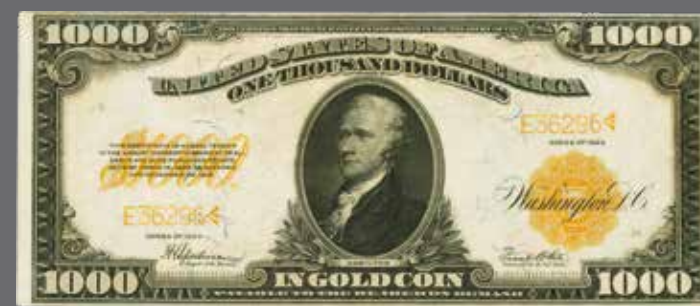
Fr. 1220 $1,000 1922 Gold Certificate PCGS Very Fine 30