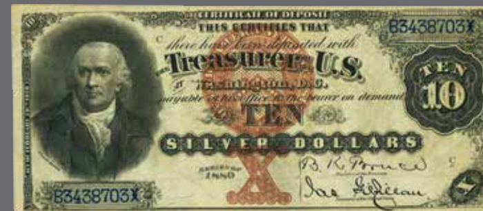
Fr. 288 $10 1880 Silver Certificate PMG Choice Uncirculated 64 EPQ