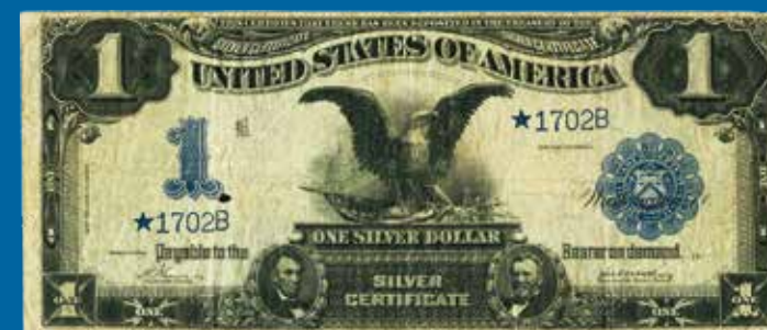
Fr. 229★-A $1 1899 Solid Star Silver Certificate PMG Very Fine 20