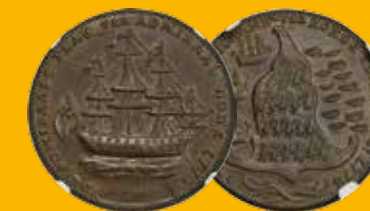
1779 Rhode Island Ship Token "Vlugtende" Removed, Brass, Betts-562 MS62 NGC