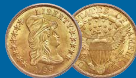
1799 Ten Dollar, MS64 PCGS Large Stars Obverse