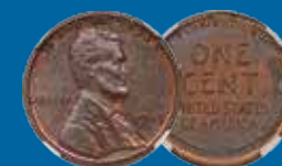
1943 Bronze Cent, MS61 Brown NGC Obverse Die Break, 3.09 grams