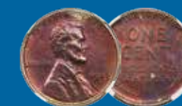
1943 Cent, MS61 NGC Struck on a Netherlands 25 Cent Planchet, 3.52 grams