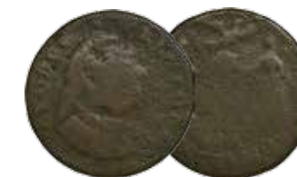
1787 George Clinton Copper