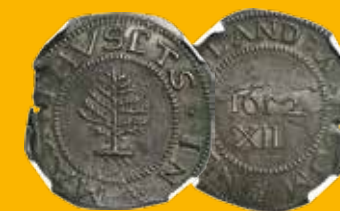
1652 Noe-1 Pine Tree Shilling Large Planchet, Pellets, 71.6 gr. MS63 NGC