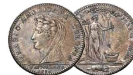
1796 Castorland Medal in Silver