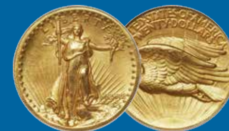
1907 High Relief Twenty Dollar PR67 NGC