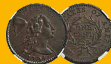
1794 Cent, AU58 NGC S-26, Ex: Dupont