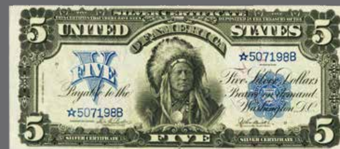
Fr. 277★ $5 1899 Silver Certificate