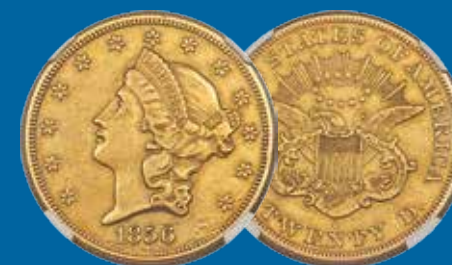
1856-O Twenty Dollar, XF40 NGC