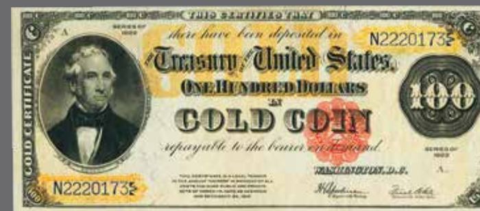
Fr. 1215 $100 1922 Gold Certificate PMG Gem Uncirculated 65 EPQ