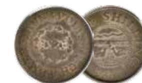
1783 Chalmers Shilling Long Worm