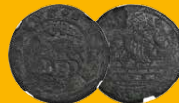
(1616) Sommer Islands Sixpence Small Portholes, VF25 NGC