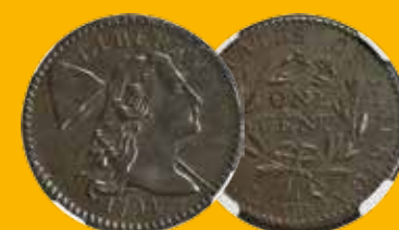
1794 Head of '94 Cent S-57, AU Details NGC