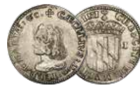
(1659) Lord Baltimore Sixpence