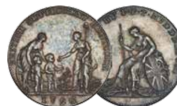
1796 Myddelton Token in Silver