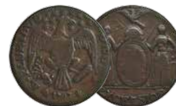
1787 New York Excelsior Copper Large Eagle on Obverse