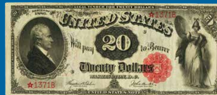
Fr. 146★ $20 1880 Legal Tender PMG Very Fine 30