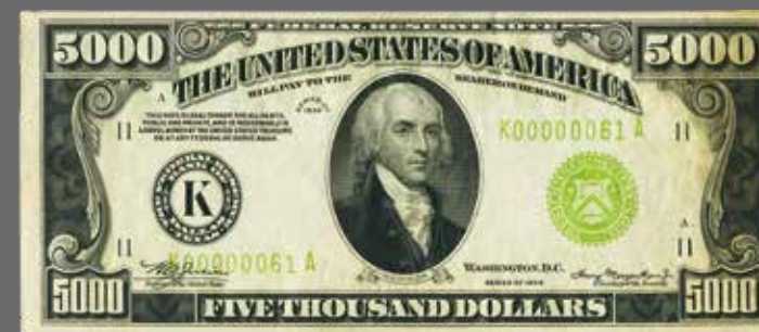
Fr. 2221-K $5,000 1934 Federal Reserve Note PCGS About New 53PPQ