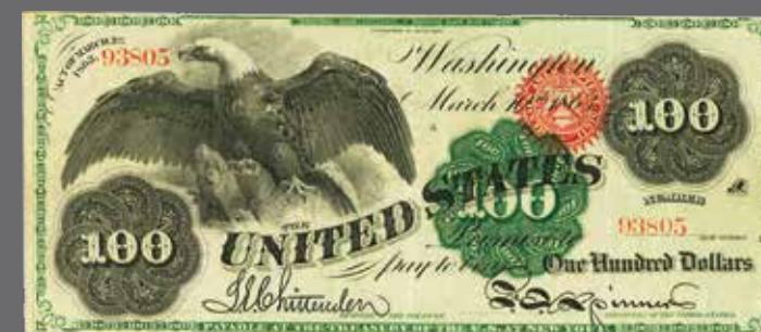
Fr. 167a $100 1863 Legal Tender