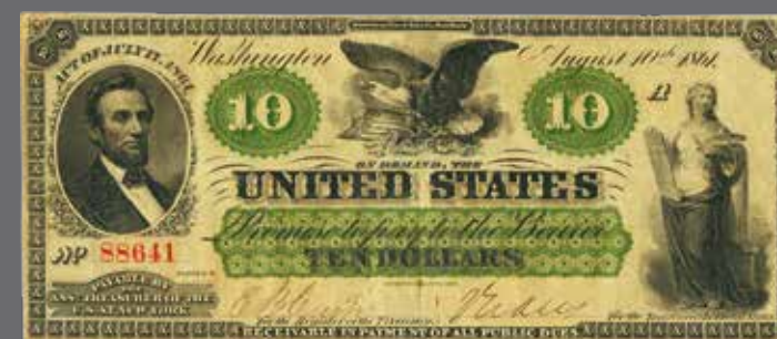
Fr. 6 $10 1861 Demand Note PMG Very Fine 30