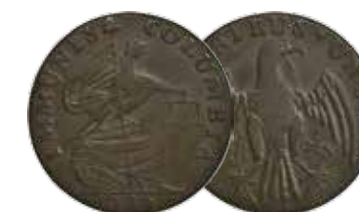
1787 Immunis Columbia Copper Eagle Reverse