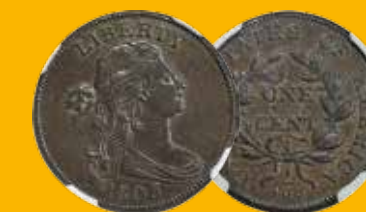
1803 Cent, AU50 NGC S-247, Small Date, Small Fraction