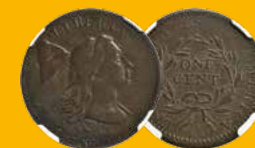
1794 Head of '93 Cent S-19a, VF Details NGC Ex: Sheldon