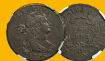
1796 Reverse of '95 Cent, AU53 NGC S-93, Ex: Bonard