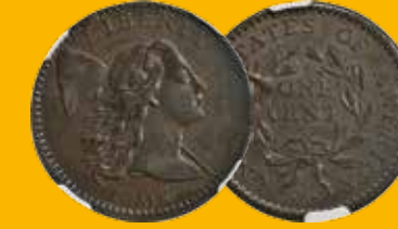
1794 Cent, AU55+ NGC S-32, Ex: Bonard