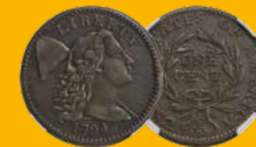
1794 Head of '94 Cent, XF40 NGC S-61, Ex: Downing