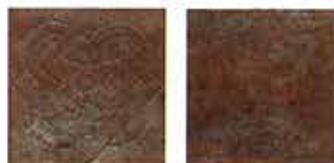
Floral deco Design deco