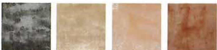
Slate 616 Leather 633 Copper 636 Rouge 634