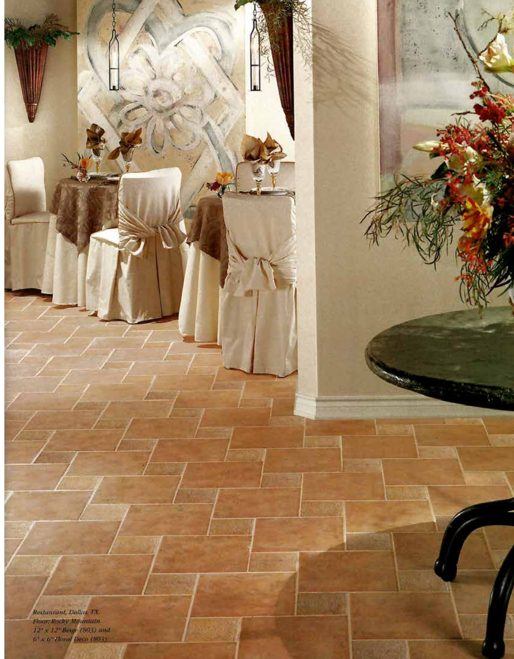
Restaurant, Dallas, TX Floor: Rocky Mountain 12" x 12" Beige (803) and 6" x 6" Floral Deco (803)