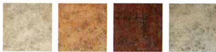
Bianco 801 Beige 803 Amaranzo 805 Grigio 804